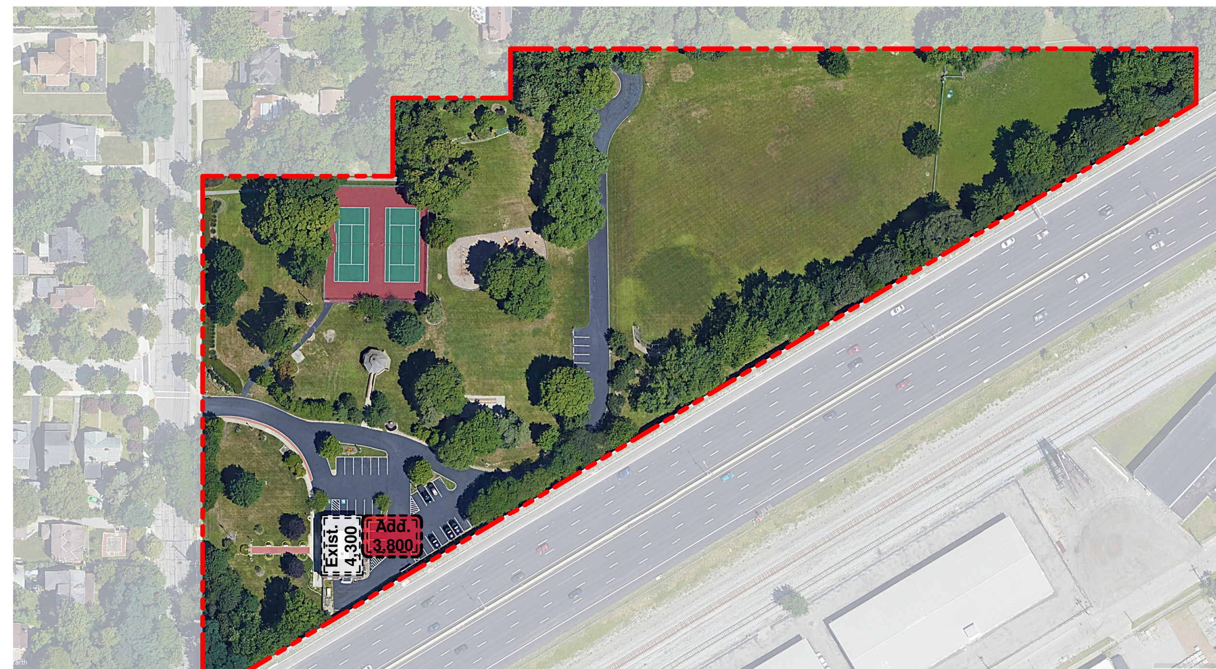
Village Admin at Village Hall - Renovation + Addition