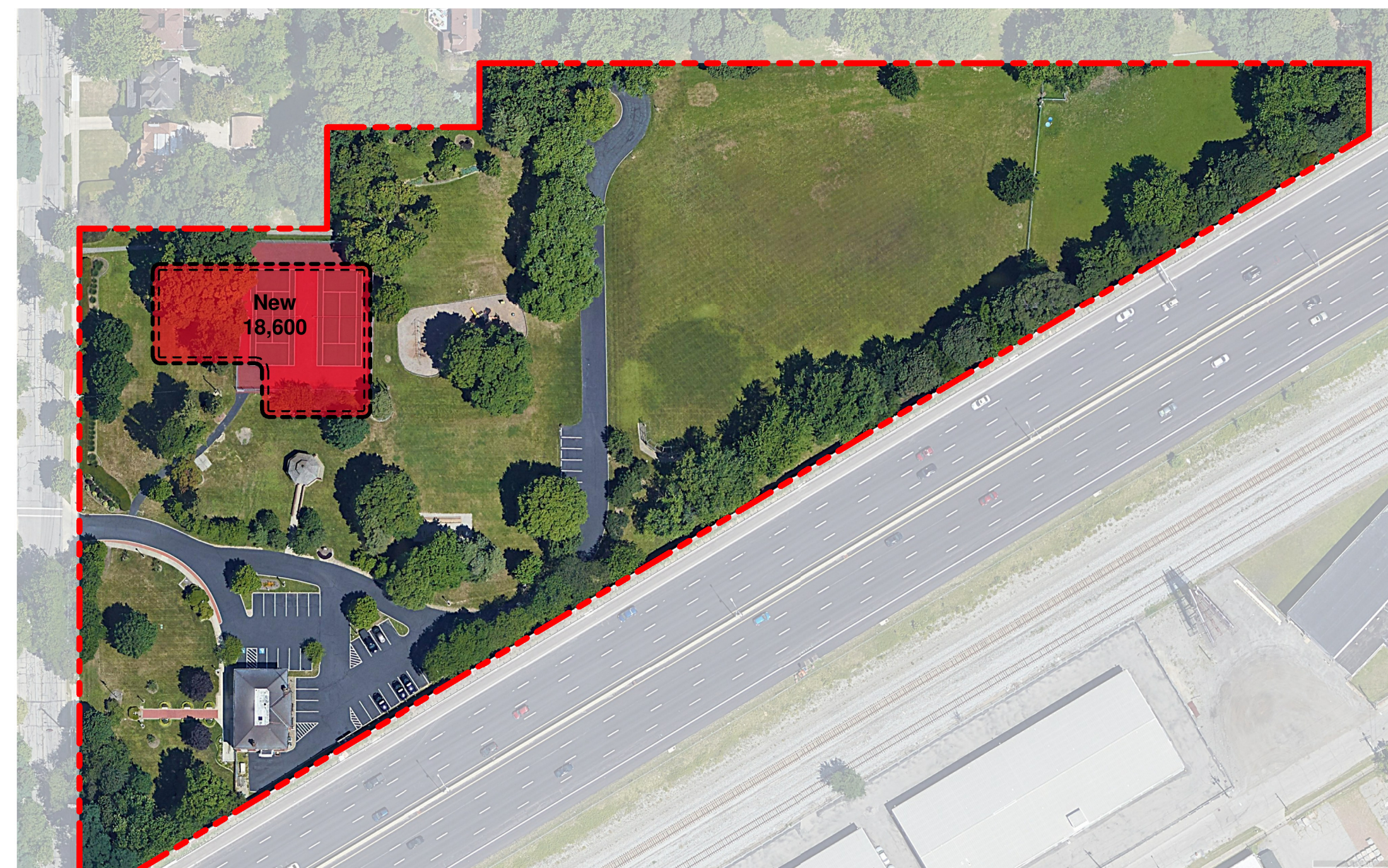
Village Admin and Police at Village Hall Site - New Construction