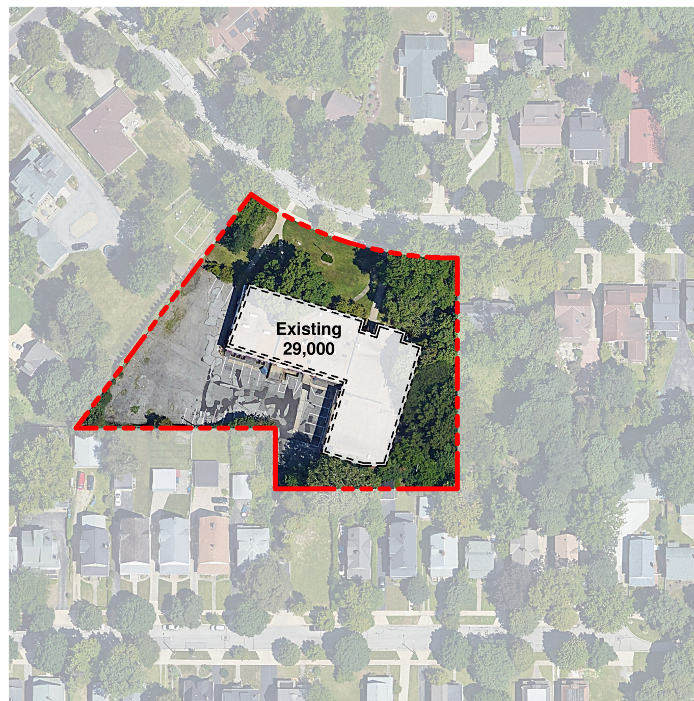
Rec to remain at Community Center