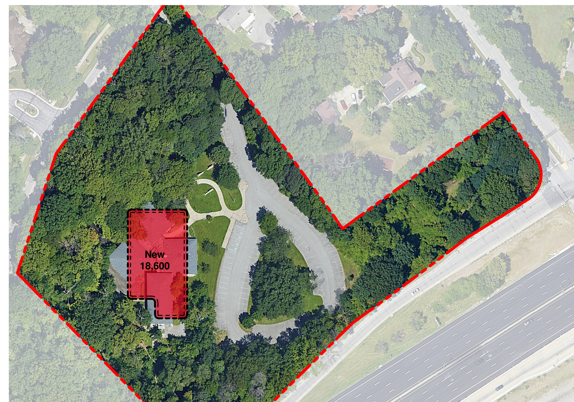
Village Admin and Police at Bratenahl Center - New Construction