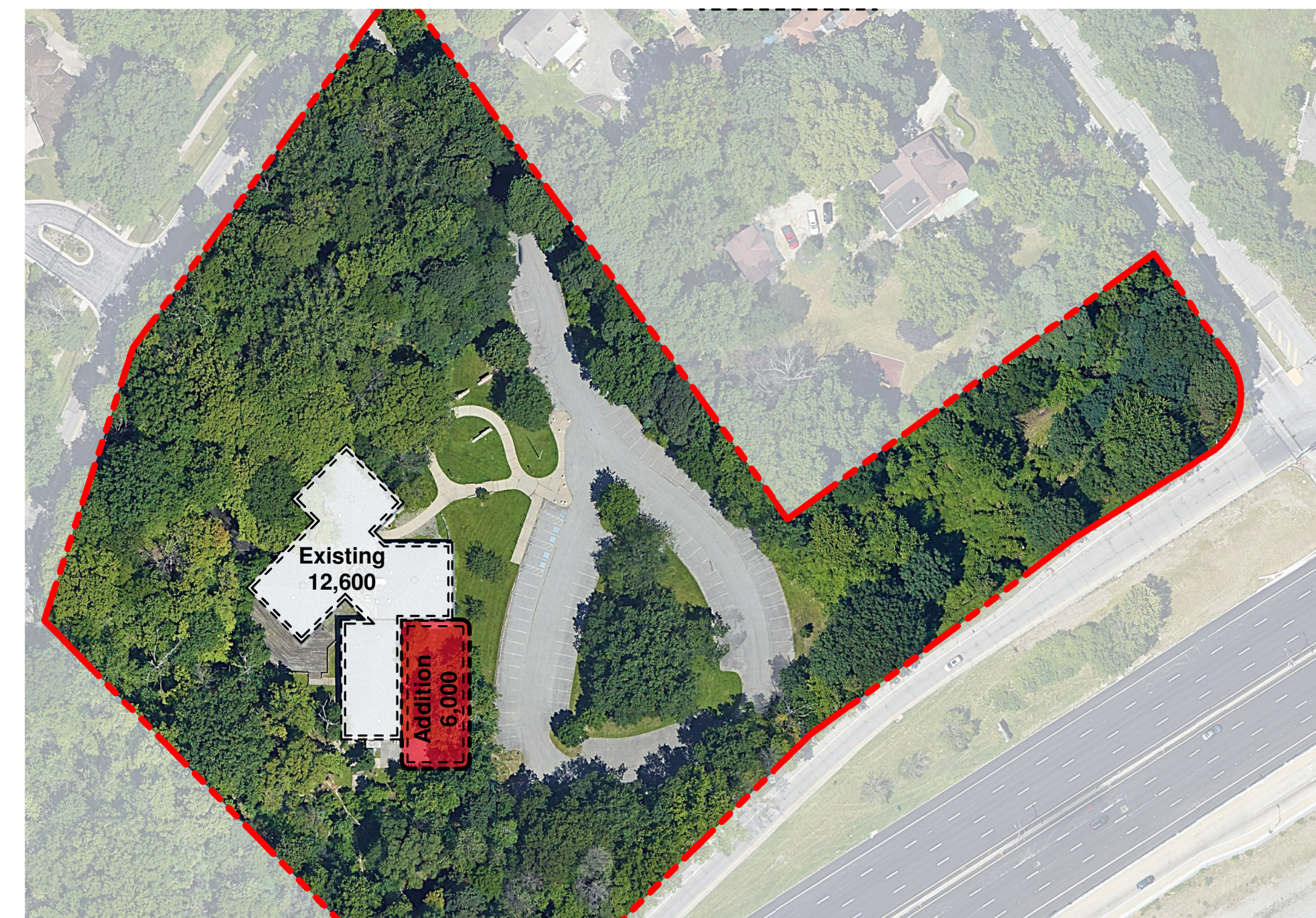
Village Admin and Police at Bratenahl Center - Renovation + Addition