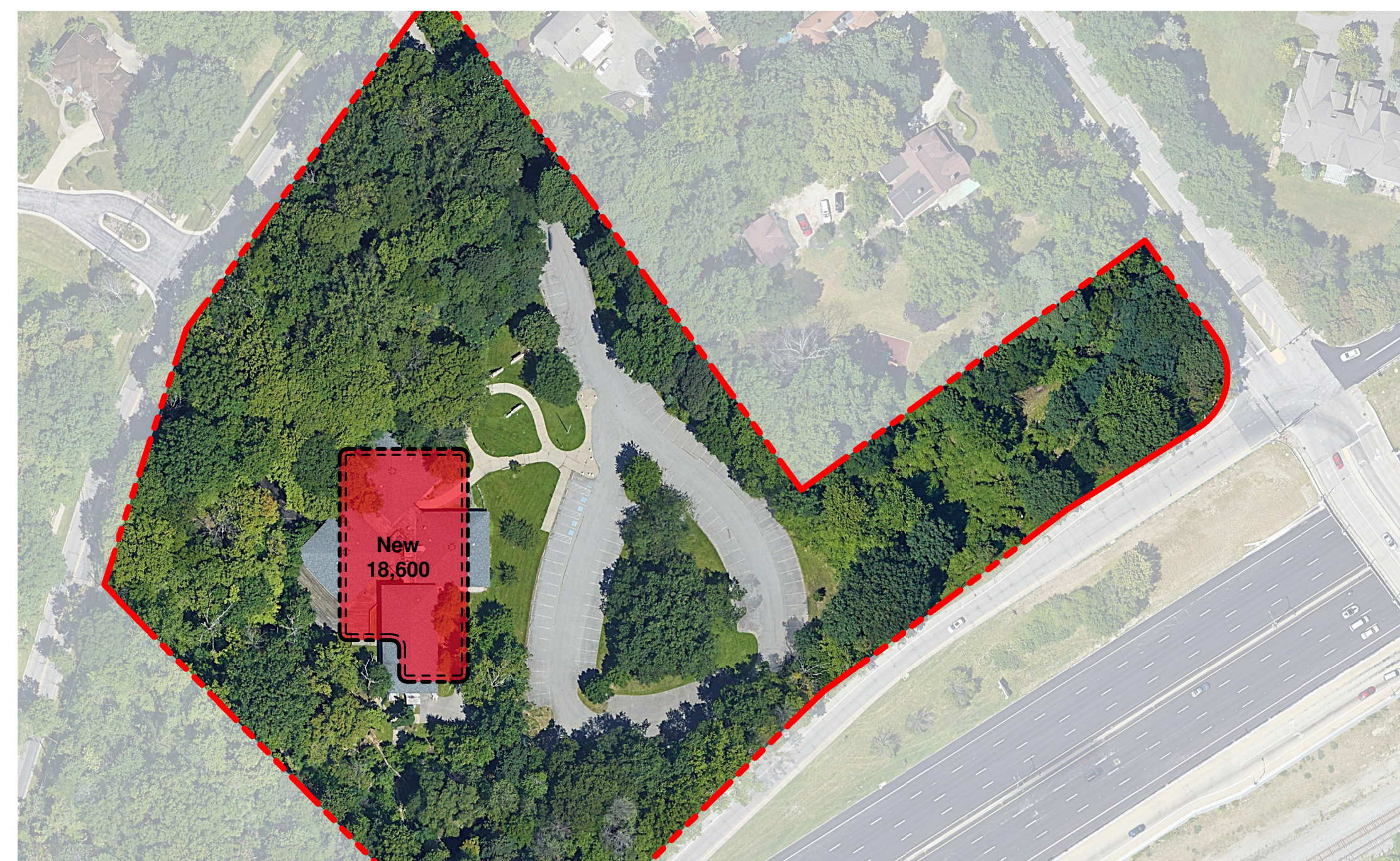
Rec at Village Hall Site - New Construction