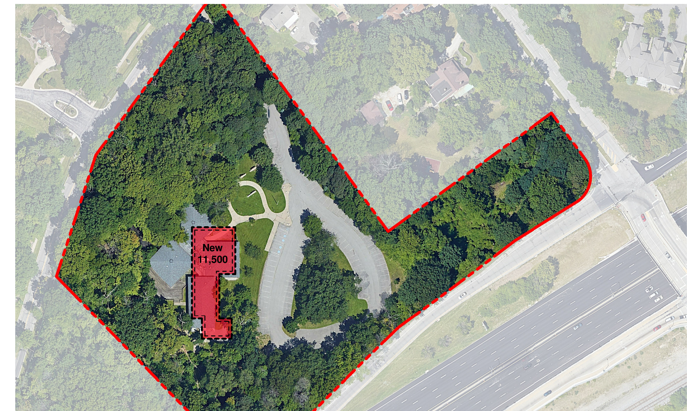
Police at Bratenahl Center - New Construction