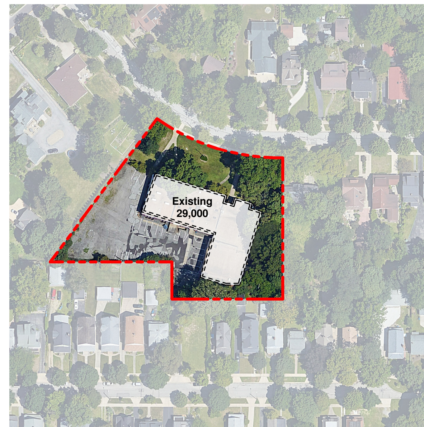
Rec to remain at Community Center