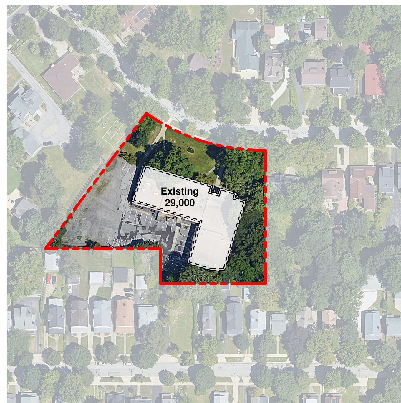
Rec to remain at Community Center