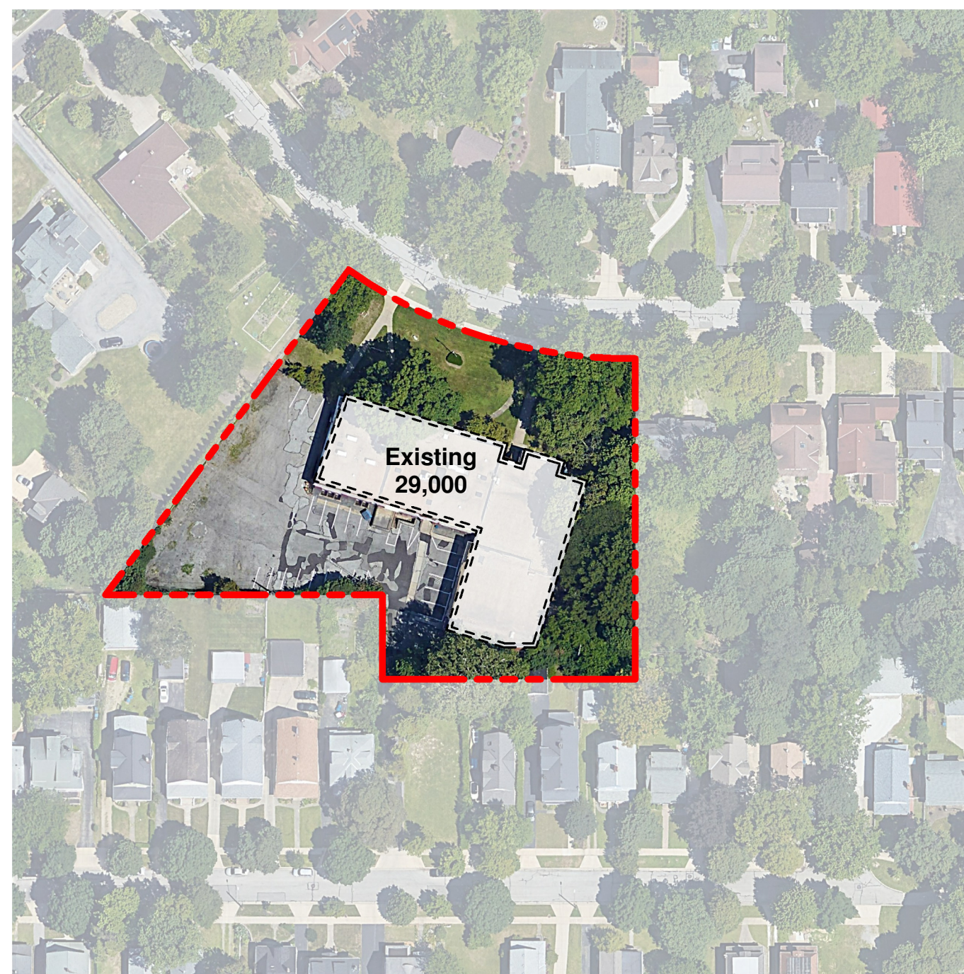
Rec to remain at Community Center