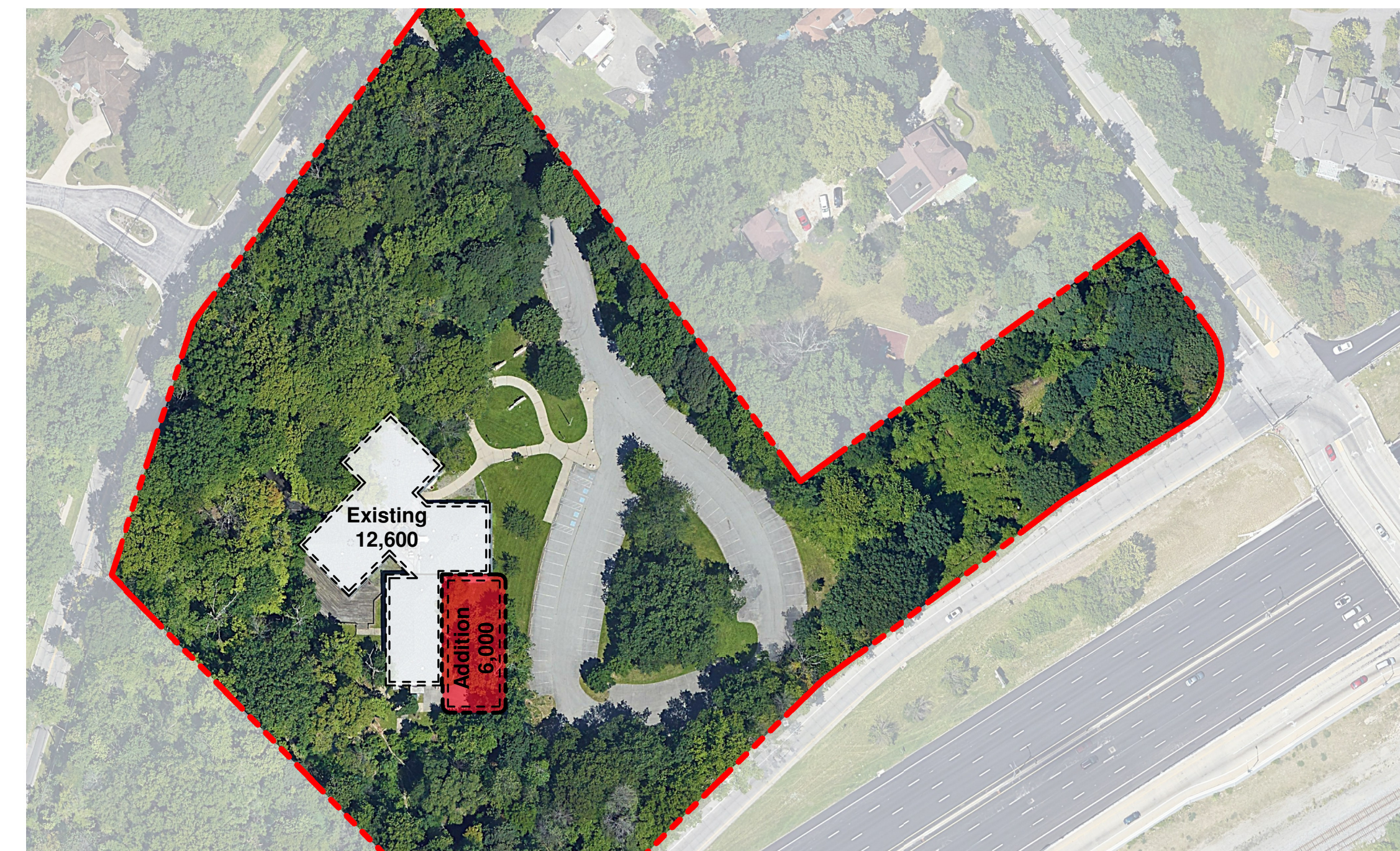
Rec at Village Hall Site - New Construction