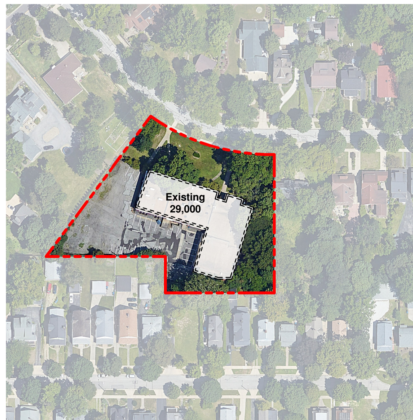
Rec to remain at Community Center