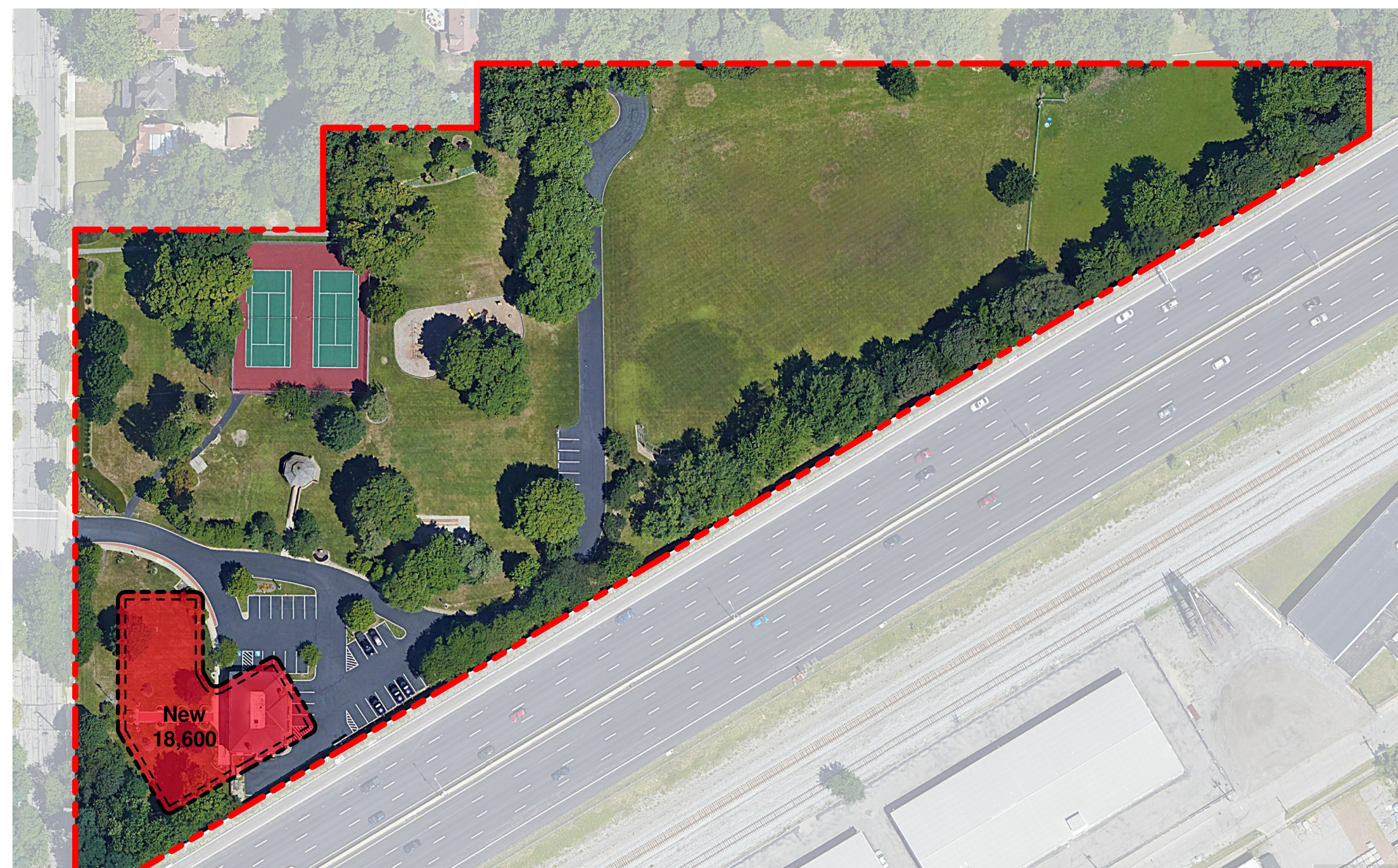
Village Admin and Police at Village Hall Site - New Construction