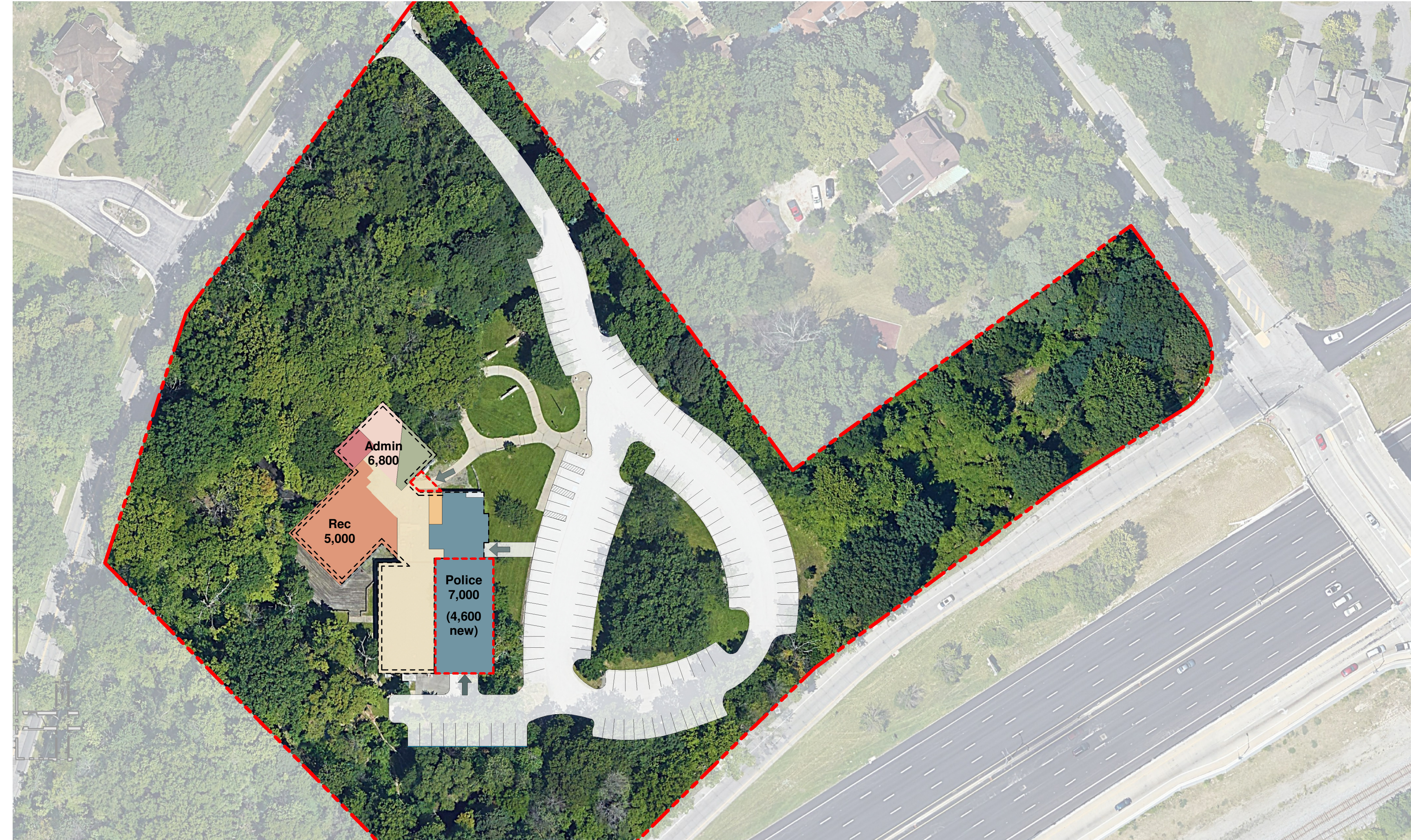
1 Bratenahl Center Plan - Option 1A.2 1/16" = 1'-0"

All services located at Bratenahl Center - Renovation + Addition